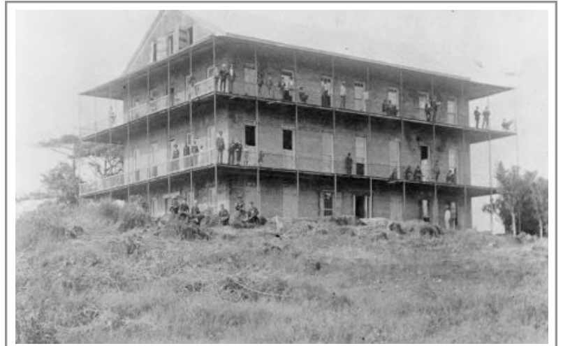
Liberia College, established in Monrovia 20 years after the American Colonization Society’s first settlement of African American emigrants in Liberia. In 1951, the college became the University of Liberia.

Massachusetts prohibited miscegenation from 1705 to 1843, but repealed the ban only because most people thought it was unnecessary. 28 The new law noted that inter-racial relations were “evidence of vicious feeling, bad taste, and personal degradation,” so were unlikely to be so common as to become a problem. 29